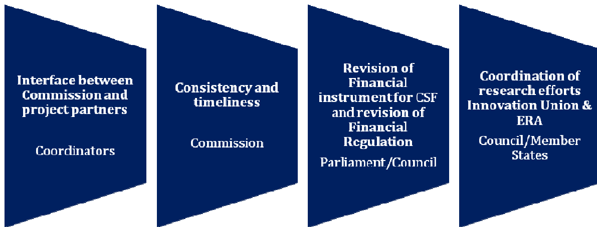
Figure 1: The role of the key players in achieving further simplification