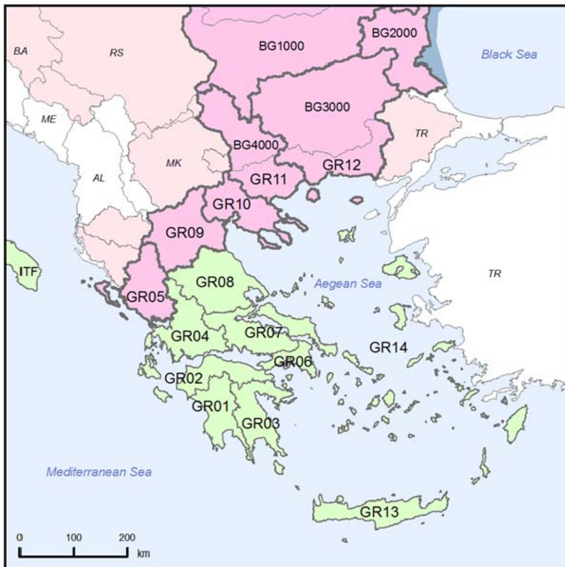
Figure 1.1: Map of River Basin District