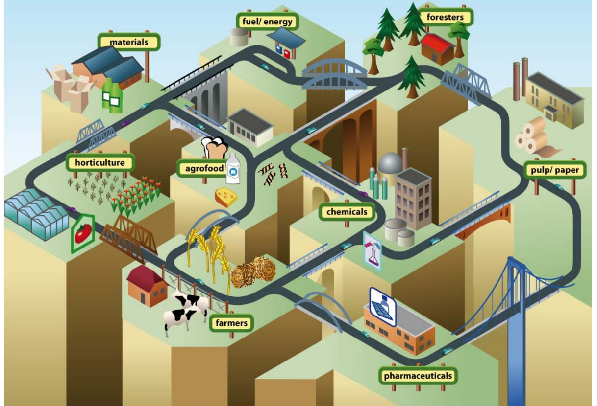
Figure 3: Bridging between the pillars – towards the Biobased Economy

BRIDGE will thus strengthen the sustainability and competitiveness of all biobased industries, by <u>strengthening the innovation pillars</u>. This increased innovation capacity will facilitate and accelerate the emergence of new sustainable value chains building on an innovative and economically strong infrastructure: effectively <u>building the bridges</u> towards new value chains (Figure 3).