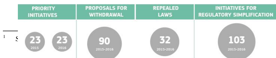
Graph 1. Better regulation in numbers over 2015-16

Nearly two years into its mandate, the Commission is on track to deliver on our better regulation commitments. From the start, our work has been framed by a focused set of political guidelines 1 to steer action over the medium term on the key challenges facing the EU: jobs, growth and investment; migration; security; digital; energy; or the deepening of the single market. Every year, concrete measures reflecting these strategies are set out in yearly, focused and streamlined Work Programmes. There were 100 initiatives in the Work Programme of 2014. In 2015, the Work Programme counted 23 new priority initiatives and packages. There were also only 23 in 2016.