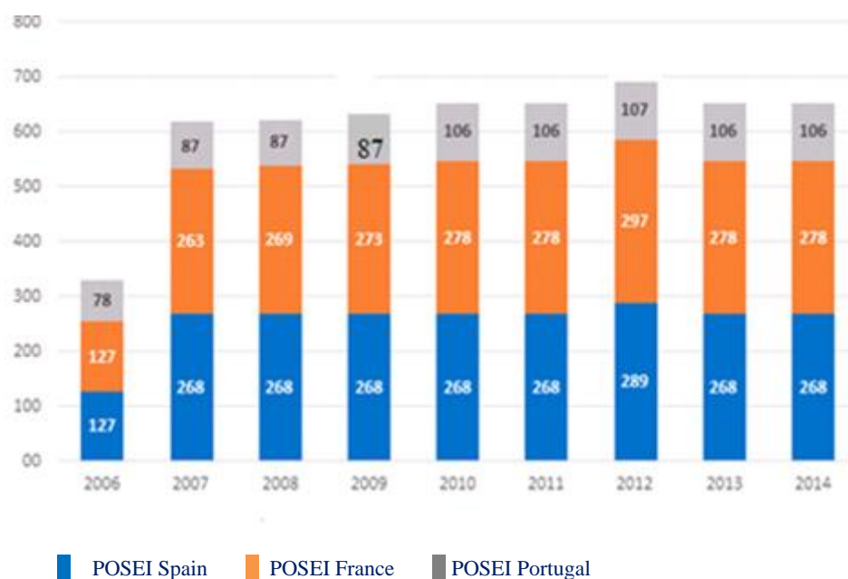
Figure 1: Financial allocations for the different support programmes in € million