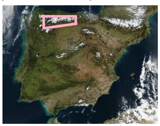
Coal Mining Districts