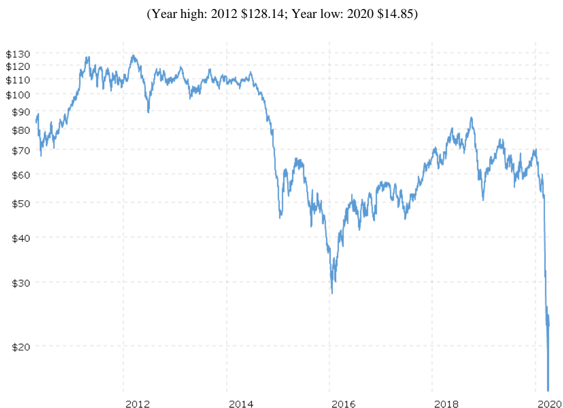
Figure 1: 10-year trend of Brent Crude price (US$/barrel)